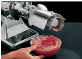
Passapomodoro per TC/TCG 12E