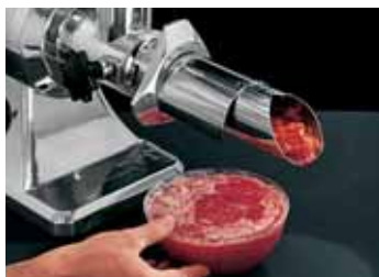
Passapomodoro per TC/TCG 22E