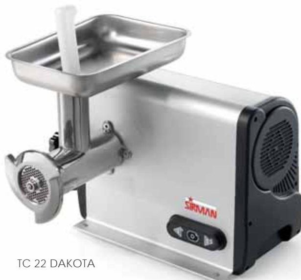
TC 22 DAKOTA