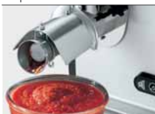
Passapomodoro per TC12