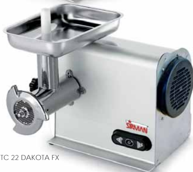
TC 22 DAKOTA FX