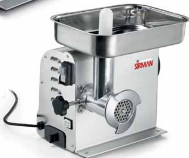
TC 8 VEGAS FX