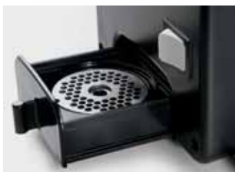
Cassetto porta coltello e piastra Compartment for knife and blade