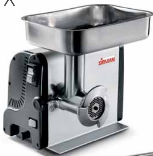
TC 8 VEGAS