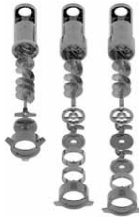
Standard o enterprise 1/2 Unger Unger Totale