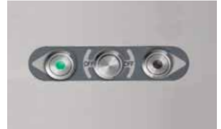
Comandi inox IP 67 Stainless steel IP 67 protected controls