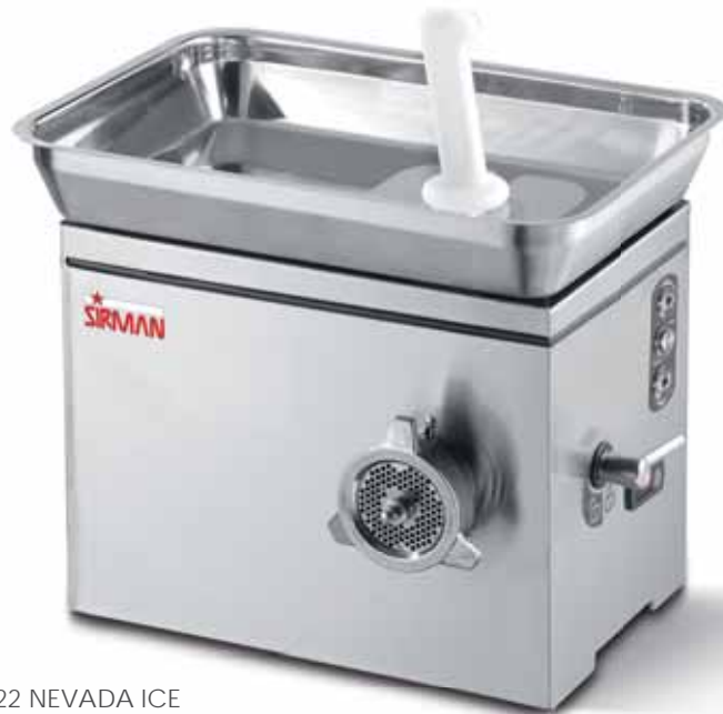
TC 22 NEVADA ICE