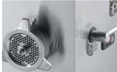
Fissaggio bocca rapido Fast fixing head system