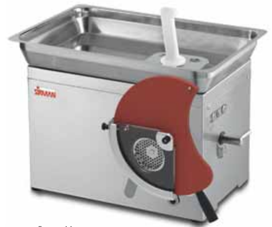
Format M Format M