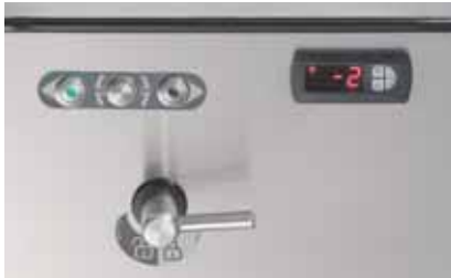
Comandi inox IP 67 modelli ICE S/steel IP 67 protected controls for models ICE