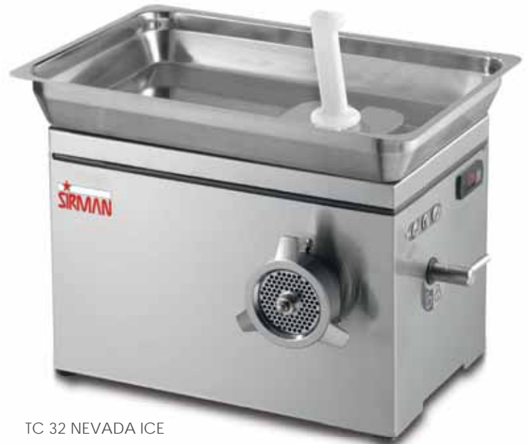
TC 32 NEVADA ICE