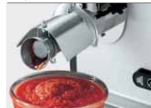
Passapomodoro per TC 12 TC 12 tomato sauce making