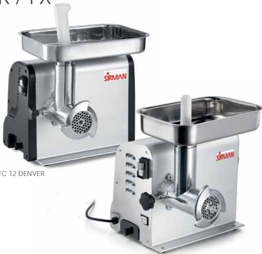
TC 12 DENVER