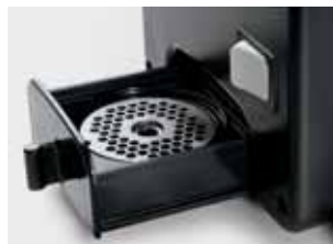
Cassetto porta coltello e piastra Compartment for knife and blade