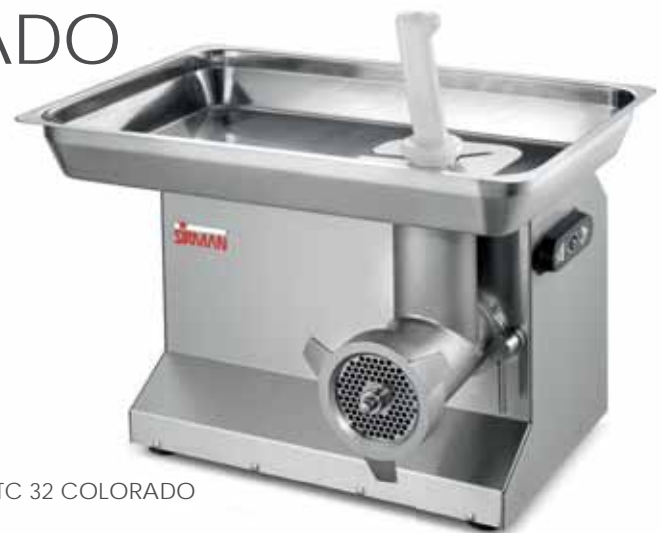
TC 32 COLORADO