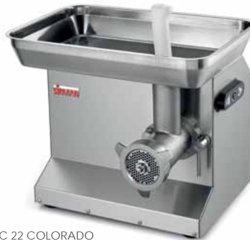
TC 22 COLORADO