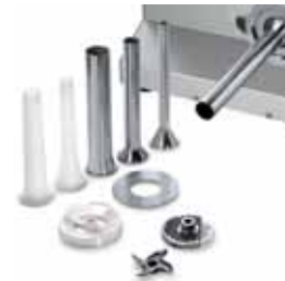
Kit insacatrice per TC 22-32 Stuffer kit for TC 22-32