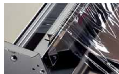
Profilo teflonato Teflon-coated section